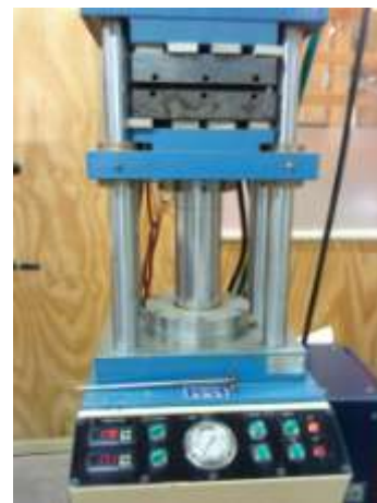
FIGURE 03: Hot platen press with cooling system

The mixed samples were then pressed in a water cooled hot platen press with a 20 cm by 20 cm platen capacity. Each batch was pressed using a temperature of 170 Celsius degrees [°C] for 15 minutes, and then cooled while the samples were still under compression. The average target thickness of the samples was 3 millimetres [m]. The densities of the panels varied from 891 to 1053 kilograms per cubic metre [kg/m 3 ]. Fig. 03 shows the hot platen press with cooling system used for pressing, heating and cooling the panels.