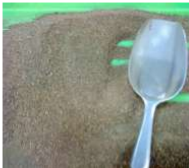
FIGURE 01: Macadamia shells ground at 40 mesh and dried overnight at 100°C

To prepare the filler materials for composite material mixing, the pine wood, macadamia shells, pine cones, and eucalyptus capsules were ground and sieved through a 40 mesh screen and dried for 15 hours at 100°C (Ayrlimis et al., 2010; Ballerini, Goycoolea, Medina, Núñez & Wechsler, 2005; Ballerini, Reyes, Núñez & Wechsler, 2005; Dundar et al., 2010; Wolcott, 2001). This was sufficient to reduce the moisture content to one percent. Fig. 01 shows ground and dried macadamia shells, prior to mixing.