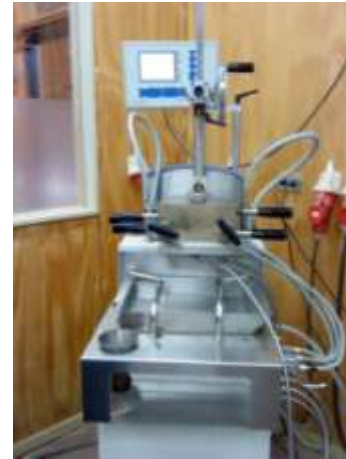
FIGURE 02: Laboratory mixer for plastic materials

shows the mixer used for material manufacture.