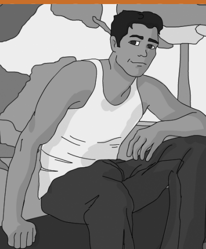
Character artwork from CRUFAD self-help module for gay men with depression ( www.climategp.tv )

In addition, the key study findings will be used to inform the development or revision of case studies and other materials used in Australasian Society for HIV Medicine (ASHM) education and training programs for s100 GP prescribers, to ensure that GPs are aware of these most recent data on the identification and management of depression and associated psychological issues amongst gay men, including people living with HIV, in Australia.