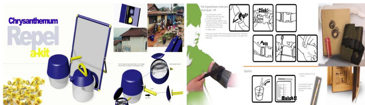
Figure 4a. Millennium Development Goals project by Dani Thai, 2008. Figure 4b. Millennium Development Goals project by Wai Yin Cheng, 2009.