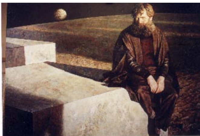
(Portraits © 1997, 2000 Hua Hue Xie – finalists in the Doug Moran prize)