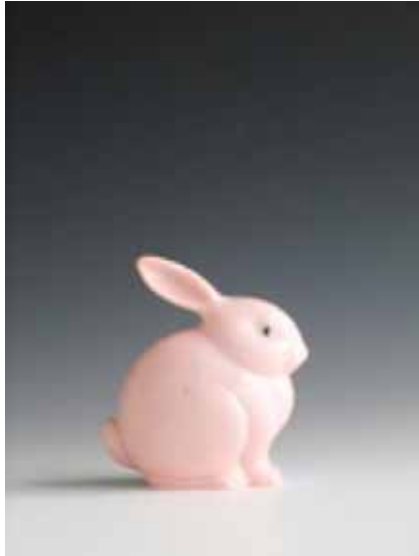
Figure 12. Plastic bunny from childhood

home and its family unit. 129 The process of retrieving this bunny and incorporating it into the making process assisted in the transition of one part of the life cycle to the next.