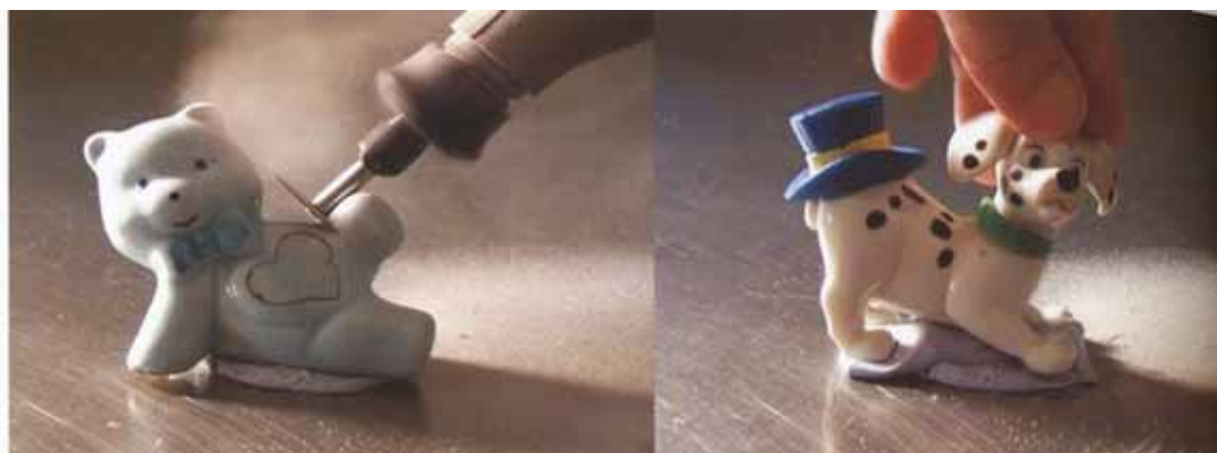
Figure 7. Lou Hubbard DRILL (Video Still) 2008 DVD, 11 minutes