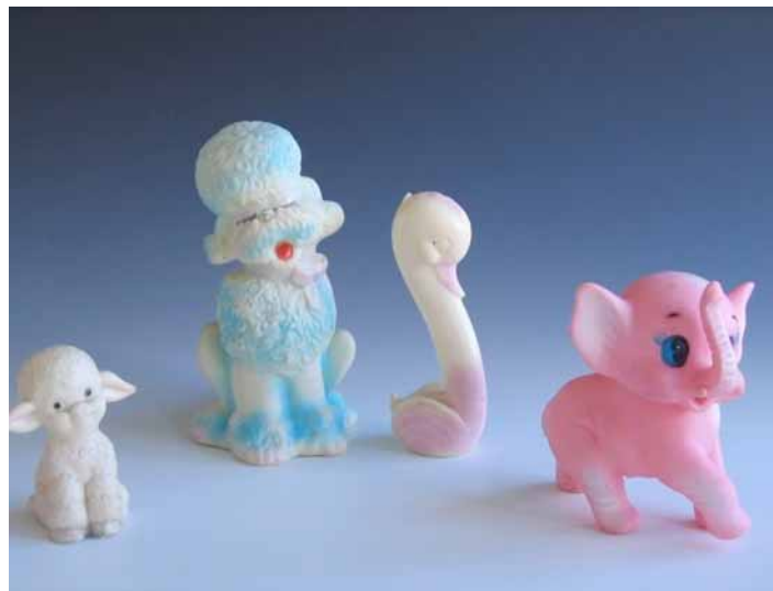
Figure 14. Souvenirs from childhood home 2007 Photograph Lynda Draper

...God sends us signs of his presence. He is manifest in every minor detail of daily life, in the most trivial act, God is not only up in heaven: he is everywhere, watching us and warning us. That means the devil, too, is lurking in his shadow, 132