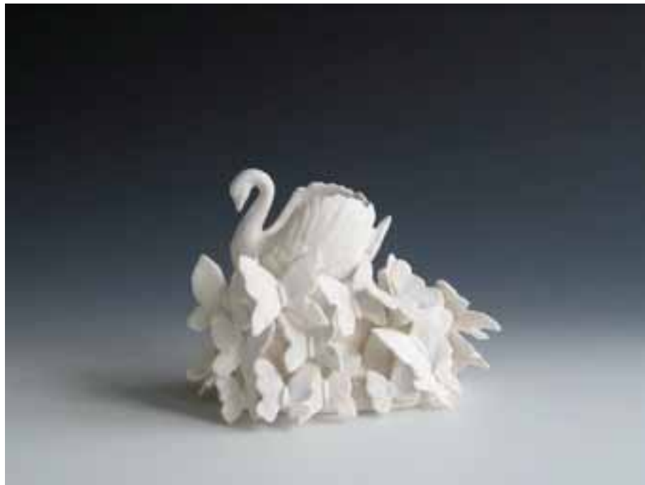
Figure 37. Lynda Draper Swan 2007, hand built porcelainous stoneware, multiple glaze firings, 13 x 20 x 12