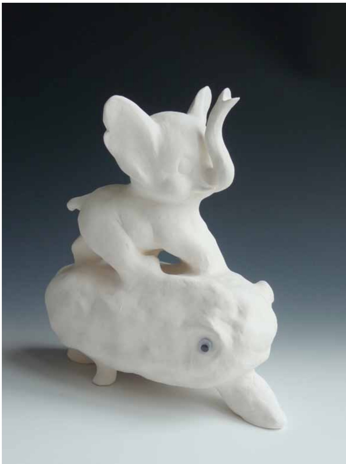
Figure 56. Lynda Draper White Elephant 2010, porcelainous stoneware, multiple glaze firings, 24 x 22 x 12 cm