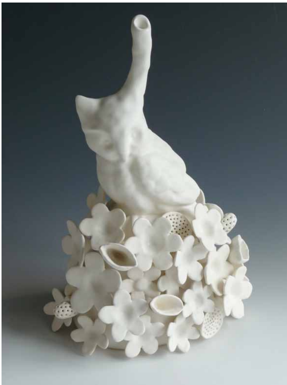
Figure 45. Lynda Draper Owl 2009, hand built porcelainous stoneware, multiple glaze firings, 26 x 20 x 12 cm