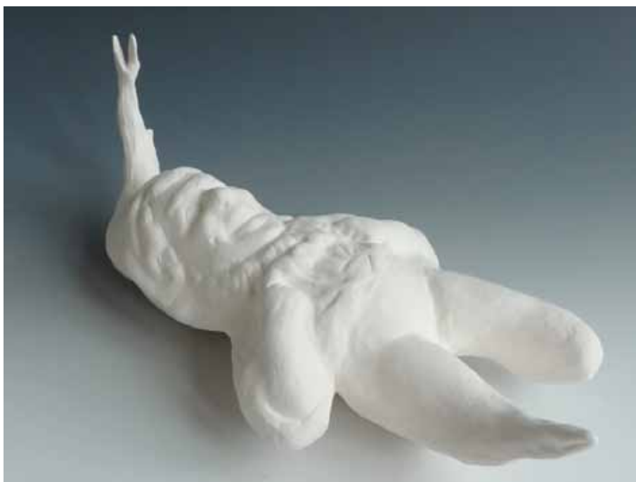
Figure 55. Lynda Draper Gnome 2010, hand built porcelainous stoneware, multiple glaze firings, 14 x 26 x 14 cm