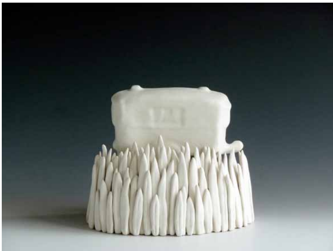
53. Lynda Draper. Caravan 2010, hand built porcelain stoneware, multiple glaze firings, 15 x 19 x 12 cm