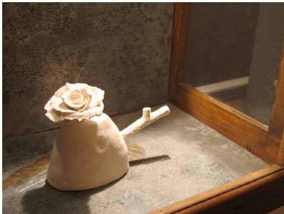
Figure 28 & 29. Lynda Draper Wonderland sass&bide 2007 Ceramic