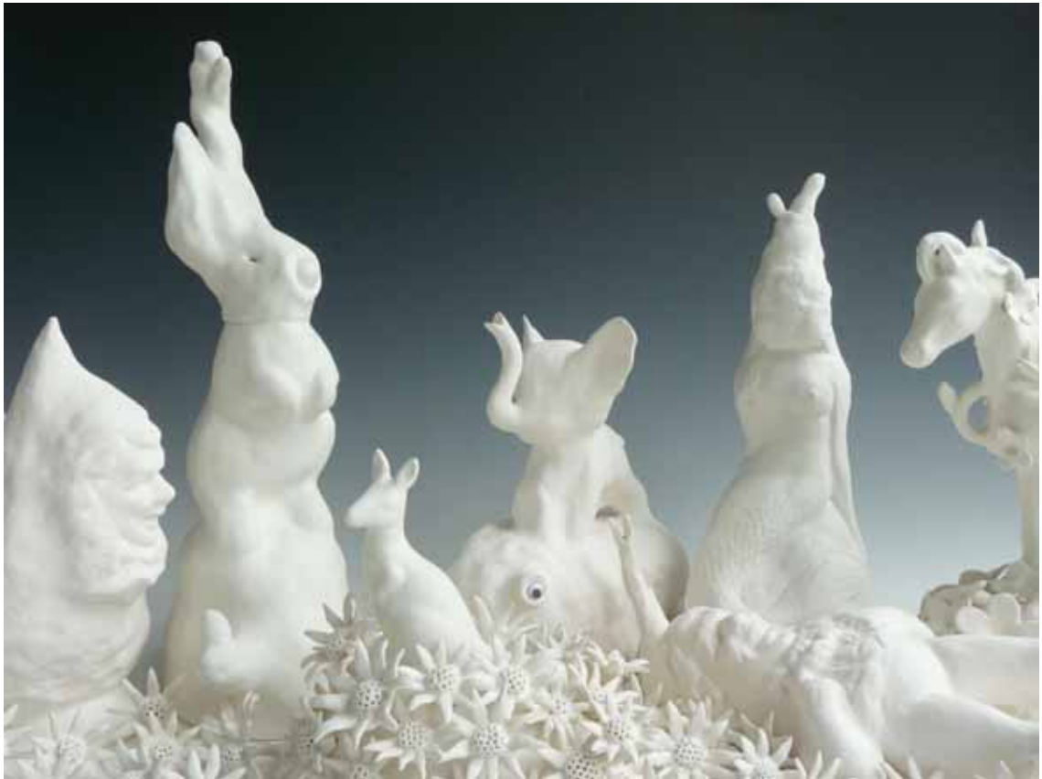
Figure 48. Lynda Draper, selection of works Home Altar 2010 ceramic, dimensions variable