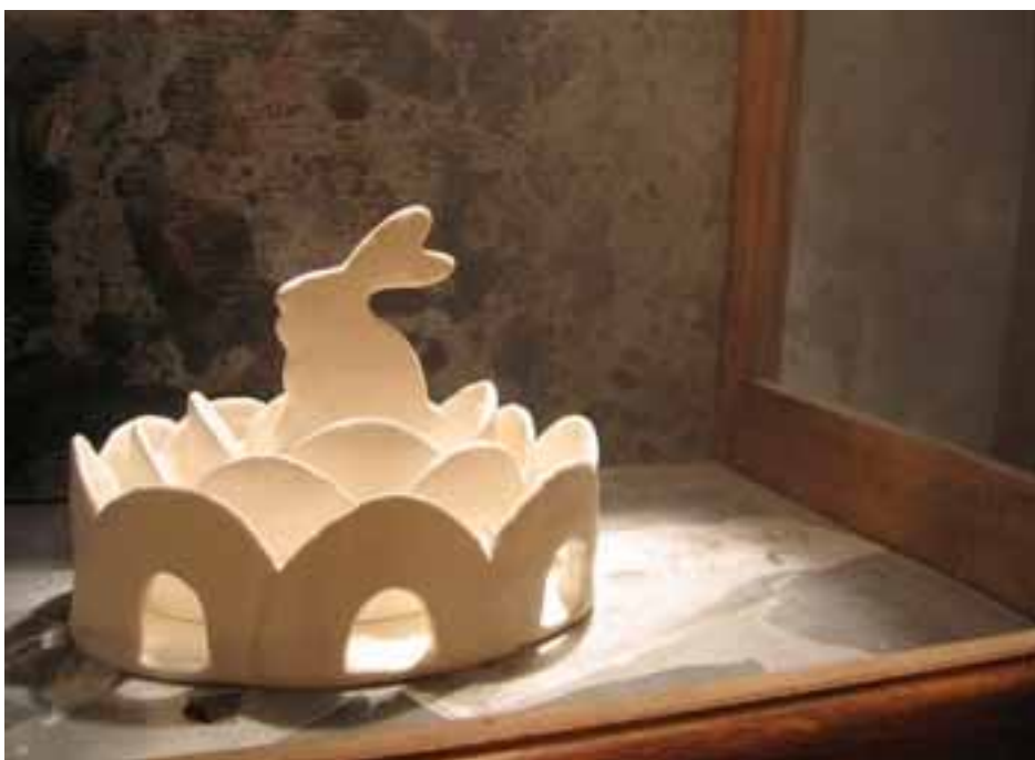
Figure 30. Lynda Draper Wonderland sass&bide 2007 17 x 16 x 15 cm