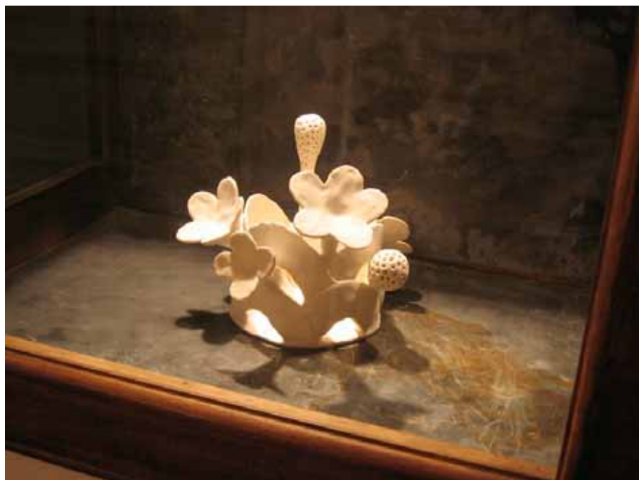
Figure 26 & 27 Lynda Draper Wonderland sass&bide 2007 Sydney, photograph Mark Draper