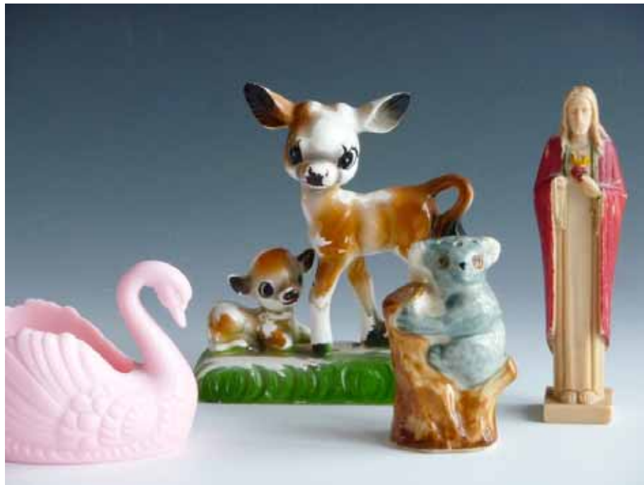
Figure 6. Souvenirs from Childhood Home

to these objects. They had a ‘property of strangeness,’ 94 a ‘daemonic’ 95 presence, as if they had a secret life within the house. These altars brought together family history recounted in these mementos linking me to what was gone and forgotten. Amidst the display of mass-produced, ordinary, suburban objects I surprisingly found a melancholy as well as a sense of love and loss, prompting me to contemplate not only links with my childhood but to those who came before.