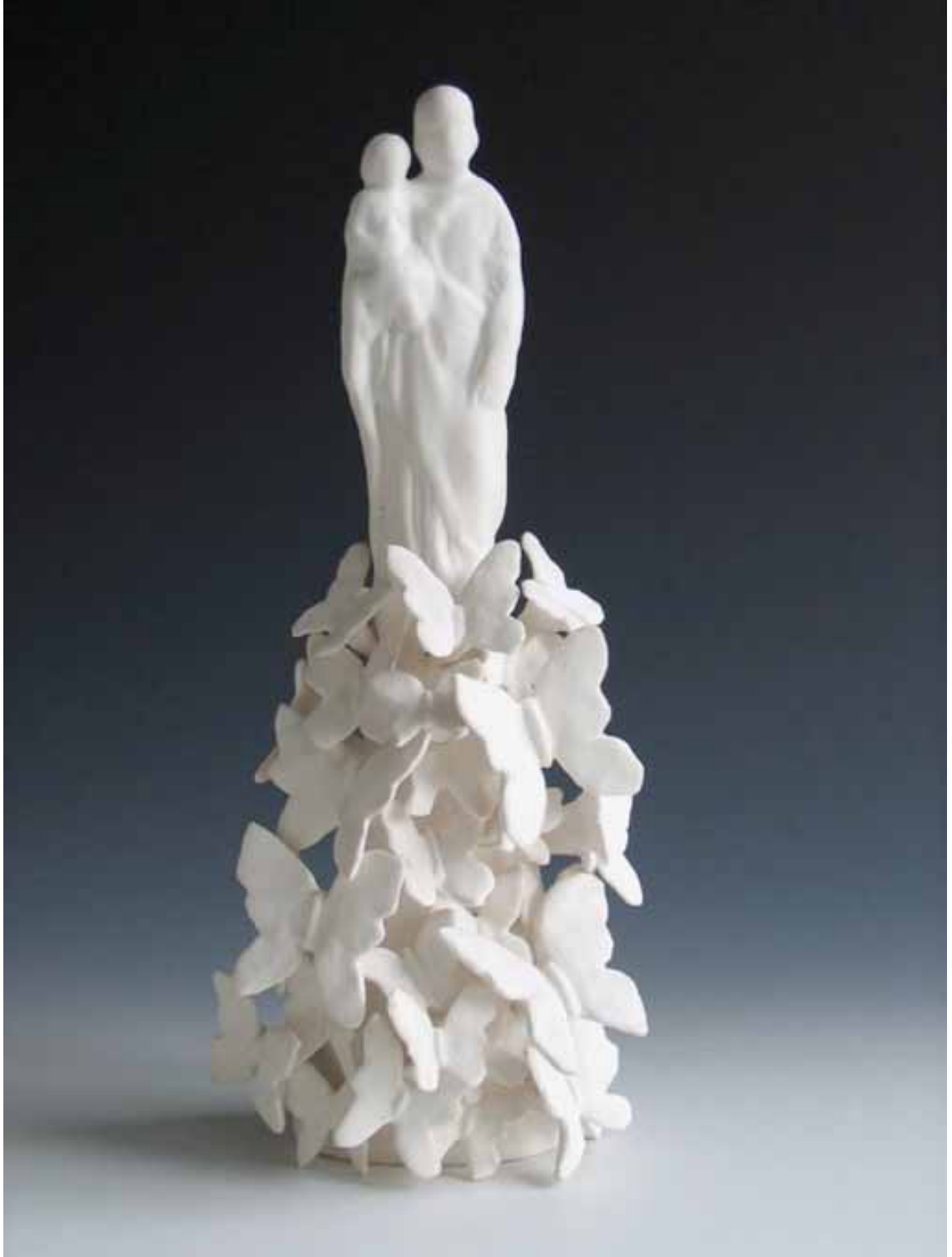
Figure 34. Lynda Draper St Joseph 2007, hand built porcelaneous stoneware, multiple glaze firings, 28 x 12 x 13 cm

Wollongong City Gallery 30 th Anniversary Exhibition November 2008 – March 2009 Installation of nine works in gallery.