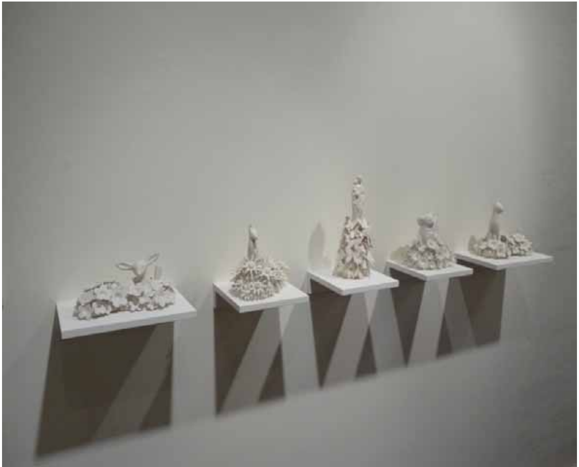
Figure 43. Lynda Draper Suburban Dreaming 2008