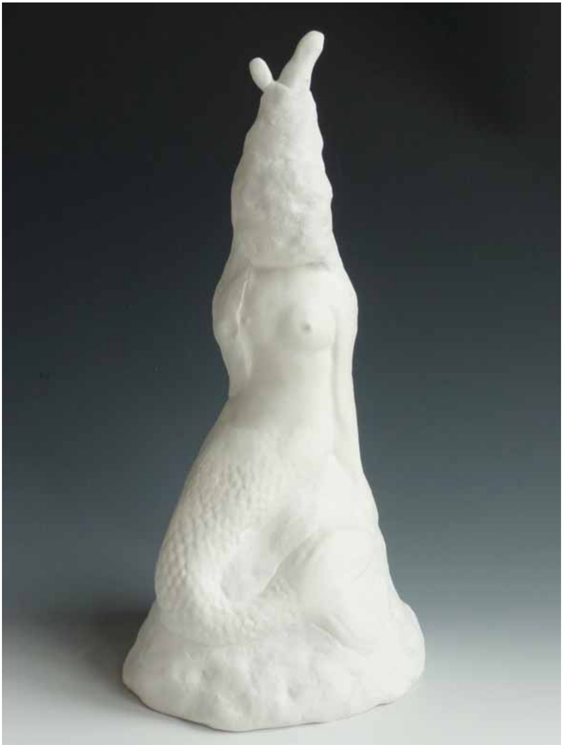
Figure 58. Mermaid 2009, porcelain stoneware, multiple glaze firings, polymer clay, 33 x 13 x 13 cm