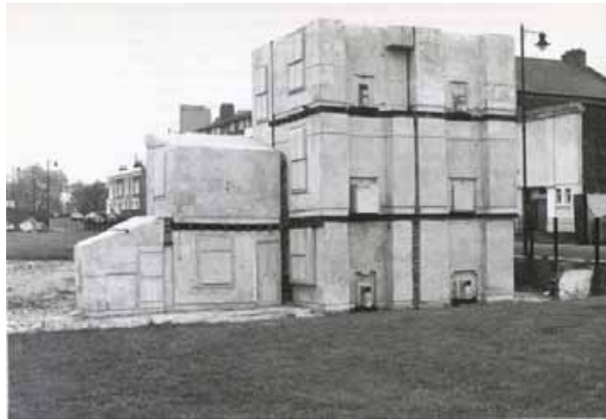
Figure 4. House 1993-1994, Cast Concrete, Rachael Whiteread 59

of the home. 57 Using materials such as rubber resin, plaster and concrete, Whiteread casts the negative spaces of objects, the spaces inside and around, thereby evoking memory and emotional responses associated with what was. Although these sculptures appear solid, they also seem ethereal ghostlike negatives of themselves. These formally functional objects and spaces associated with the comfort of the home leave us with a sense of unease and intrigue, uncanny replicas that seem familiar yet strange. 58