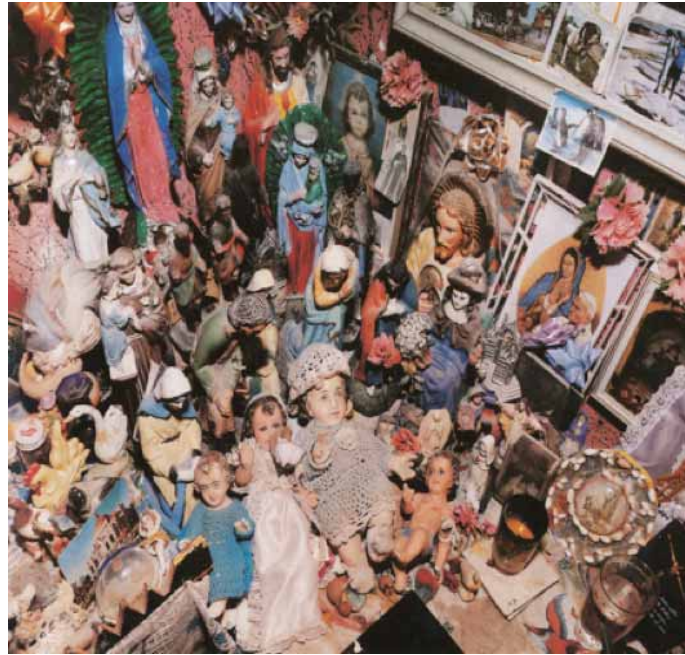
Figure 10. A Home Altar of Mexico 1997

By imbuing inanimate objects with meaning and memory humans have attempted to mediate loss and change and ultimately tried to create a way of controlling the inevitable final separation of death. Raffael Rheinsberg (1943-) is a contemporary artist whose work explores the way mundane manufactured objects can ‘speak’ to us. His work consists of found objects collected from places such as garbage dumps and abandoned buildings, which are utilised unchanged in his installations. He suggests that ‘every object has a soul’ given to it by the person who used it during the course of their life.’ 122 Rheinsberg relates strongly to the traditional culture of Mexico where it is common practice to recycle discarded objects into useful items. This practice reflects a cyclical view of the world, insuring a continuity of memory and helping to expel the fear of death. 123 Rheinsberg’s interest in the power Mexicans invest in material culture led to my investigation into the tradition of the home altar in indigenous Mexicans homes. (Figure 10) These altars display a combination of European Catholic ideas, indigenous animistic beliefs and intimate family histories. 124 Personal items from departed relatives are usually incorporated within religious icons and images. Valuable family keepsakes and skillfully crafted artefacts sit with kitsch and mass-produced