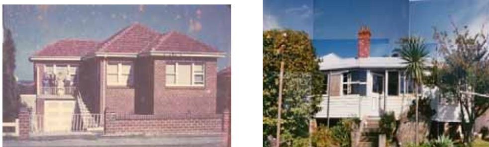
Figure 16. Childhood Home 1957 Photographer unknown. Thirroul Home 1989 Photographer Lynda Draper