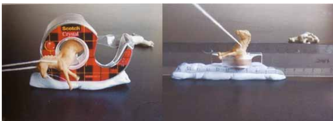
Figure 9. Lou Hubbard HACK (Video Still) 2006, DVD 6.9 minutes 121