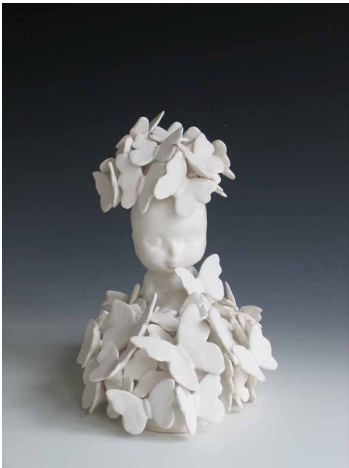
Figure 41. Lynda Draper Doll 2008 hand built porcelainous stoneware, multiple glaze firings, 21 x 13 x 23 cm