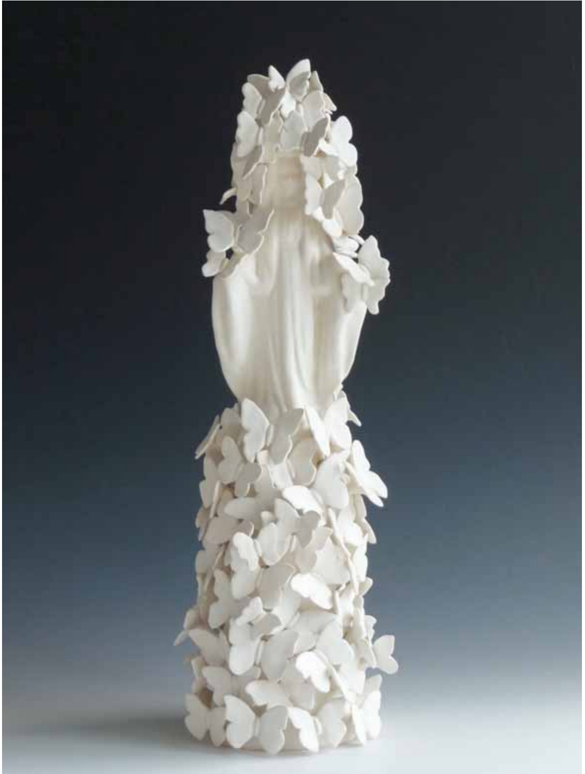
Figure 44. Lynda Draper, Mary 2009 hand built porcelainous stoneware, multiple glaze firings, 38 x 14 x 14

Stella Downer Fine Art Ceramics exhibition in conjunction with the Ceramics Triennale 09 . July 7- 26 'Mary' acquired by the National Gallery of Australia