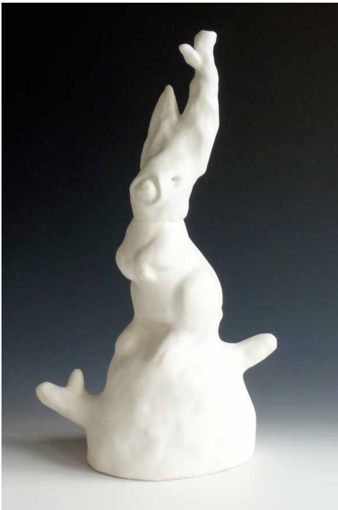
Figure 47. Lynda Draper Rabbit 2009, hand built porcelainous stoneware, multiple glaze firings, 42 x 25 x 20 cm