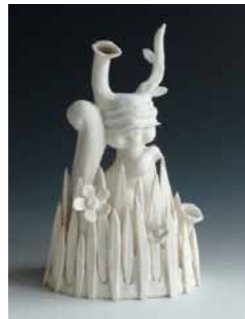
Figure 22. Lynda Draper Squirrel