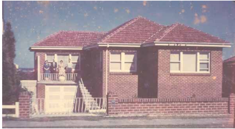
Figure 1. My Childhood Home, 1957- 2007.