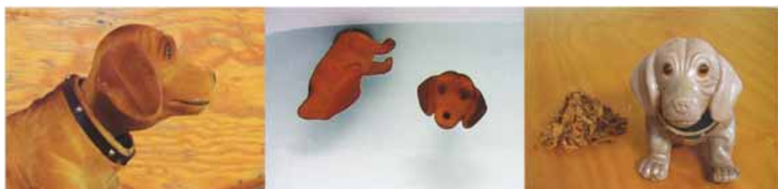
Figure 8. Lou Hubbard DEPORTMENT (Video Still) 2007, DVD 8.5 minutes