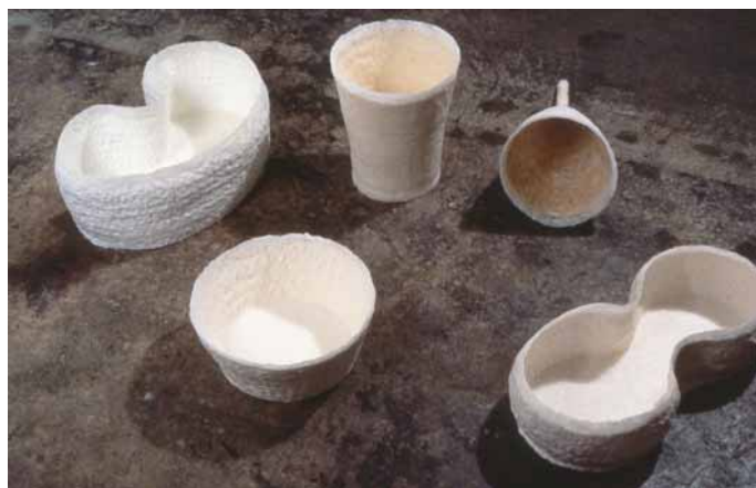
Figure 18. Lynda Draper Untitled 2003 Ceramic and wax 4 x 4 x 4 m