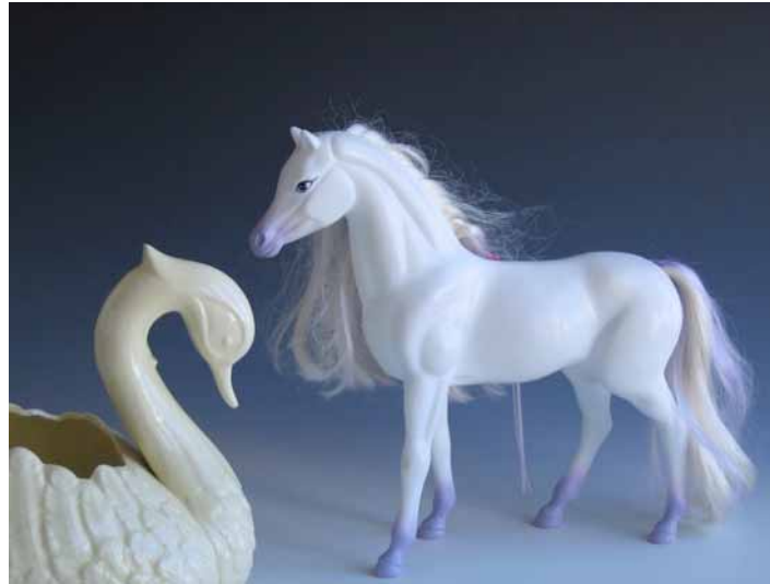
Figure 15. Souvenirs from childhood home 2007

inanimate is akin to resurrecting the dead. 133 These factors create a vision of a suburban home filled with cartoon zombies with the devil lurking in every corner.