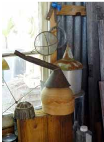
Figure 17. Artefacts from Thirroul Home Photograph Lynda Draper

(Figure 18) measuring 4 x 4 x 4 metres, consisting of large scattered ceramic and wax objects, was the starting point to my more current work and my investigations into the resonances of domestic objects and their psychological associations. This work was inspired by metal washing basins, buckets and funnels from our old bathhouse. The hybrid nature of the wall pieces in the exhibition would be used in future work and the wax surfaces would be interpreted using a combination of glazes and firings.