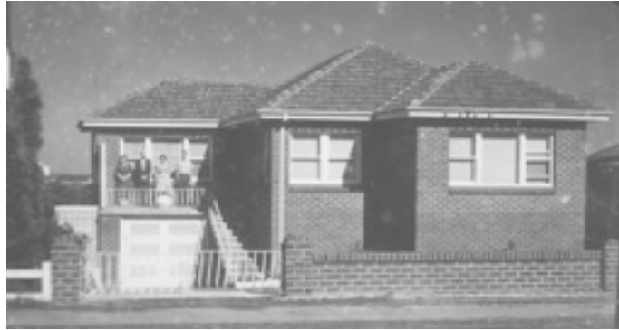
Figure 5. My Childhood Home 1957- 2007

present, encapsulating a period in the history of Australian suburbs in particular the suburb of Cronulla and the area before its' redevelopment. It was demolished exactly fifty years after my parents finished building it.