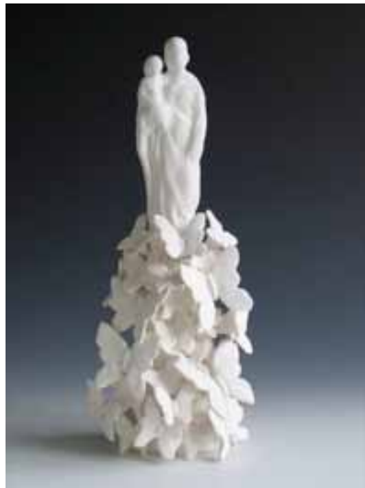
Figure 20. Lynda Draper St Joseph 2007, hand built porcelaneous stoneware, multiple glaze firings, 28 x 12 x 13 cm