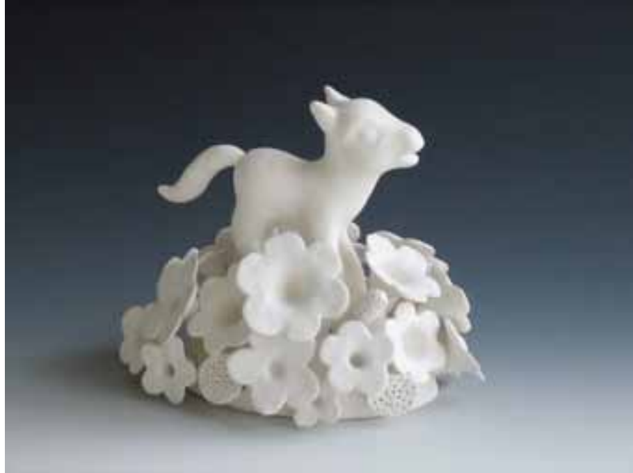
Figure 31. Dream Pony 2006, Hand built porcelainous stoneware, multiple glaze firings, 13 x 20 x 12 cm

Curated by Peter Fay. Three works selected one painting and two ceramic works