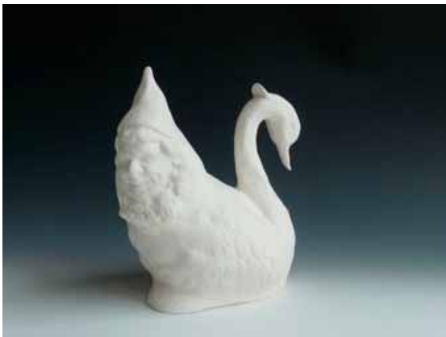
Figure 54. Lynda Draper Swan 2010, hand built stoneware, multiple glaze firings, 24 x 25 x 16 cm