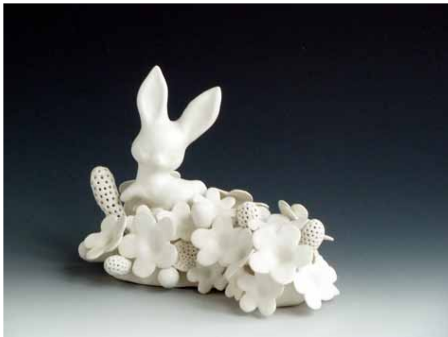
Figure 40. Lynda Draper Rabbit 2008, hand built porcelainous stoneware, multiple glaze firings, 18 x 5 x 16 cm