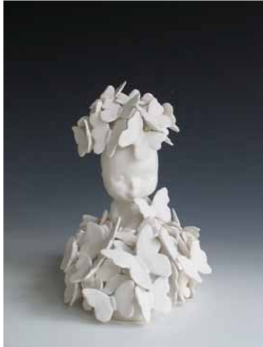
Figure 23. Lynda Draper Doll 2008, porcelaneous stoneware, multiple glaze firings, 21 x 13 x 23 cm

segue between nostalgia and the uncanny that has been the focus of my inquiry. This doll accompanied me throughout childhood. In early childhood this doll functioned