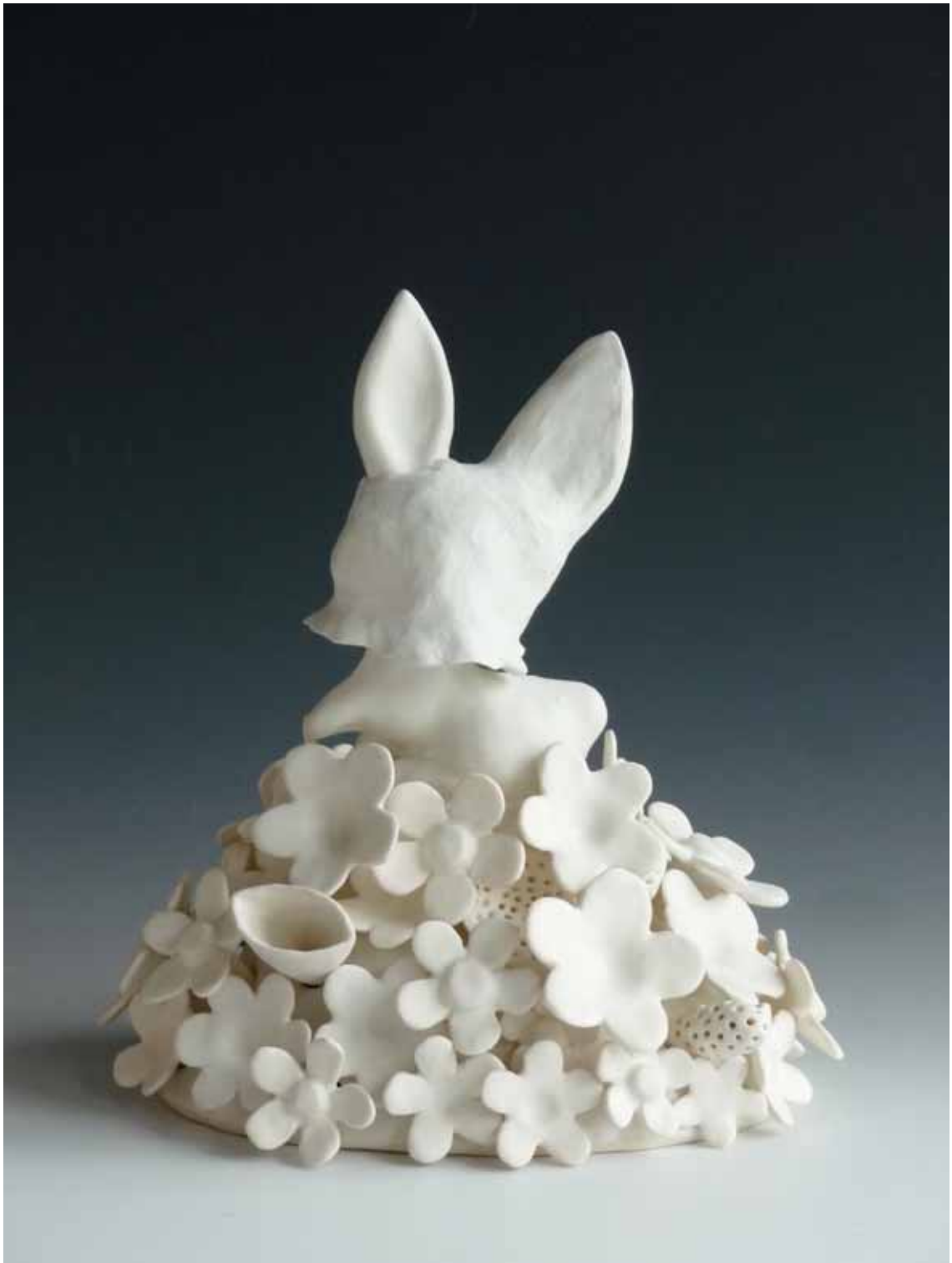
Figure 42. Lynda Draper, Rabbit 2009, hand built porcelainous stoneware, multiple glaze firings, polymer clay, 14 x 20 x 12 cm