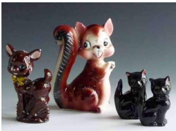
Figure 21. Souvenirs from Childhood .