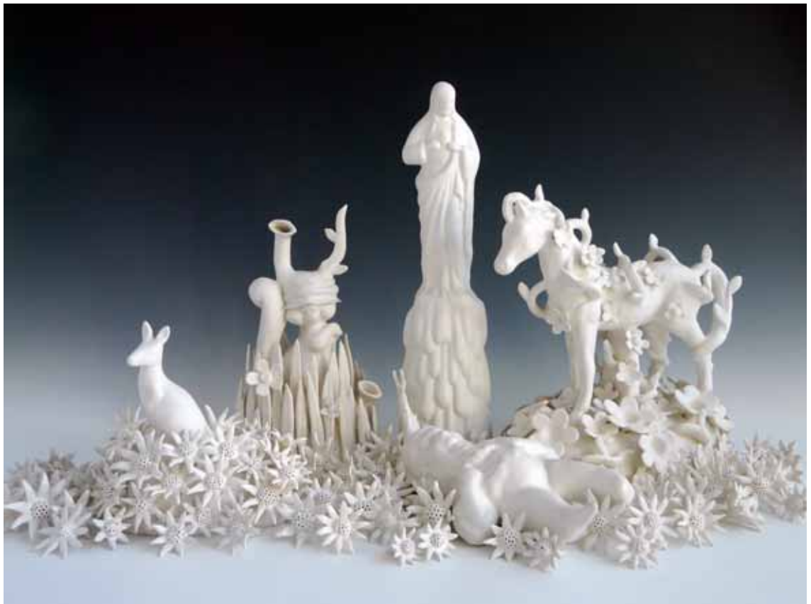
Figure 24. Lynda Draper, selection of works Home Altar 2010, porcelainous stoneware, multiple glaze firings dimensions variable.

assisted in my reconstruction of the past but also gave an insight into understanding the power of material culture in life's journey.