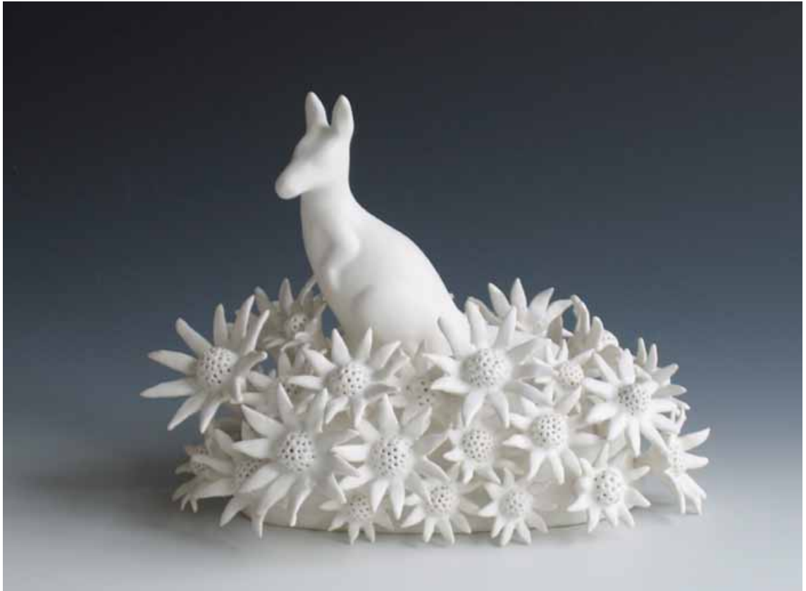
Figure 33. Lynda Draper Kangaroo 2008, hand built porcelaneous stoneware, multiple glaze firings, 19 x 17 x 10 cm

Figure 33. Lynda Draper Kangaroo Single work installed on a shelf in gallery 2