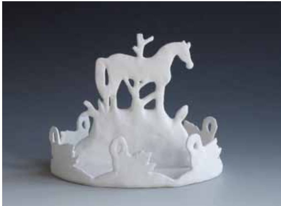
Figure 32. Lynda Draper, Island Dream 2006, hand built porcelainous stoneware, multiple glaze firings 9 x 9 x 8 cm