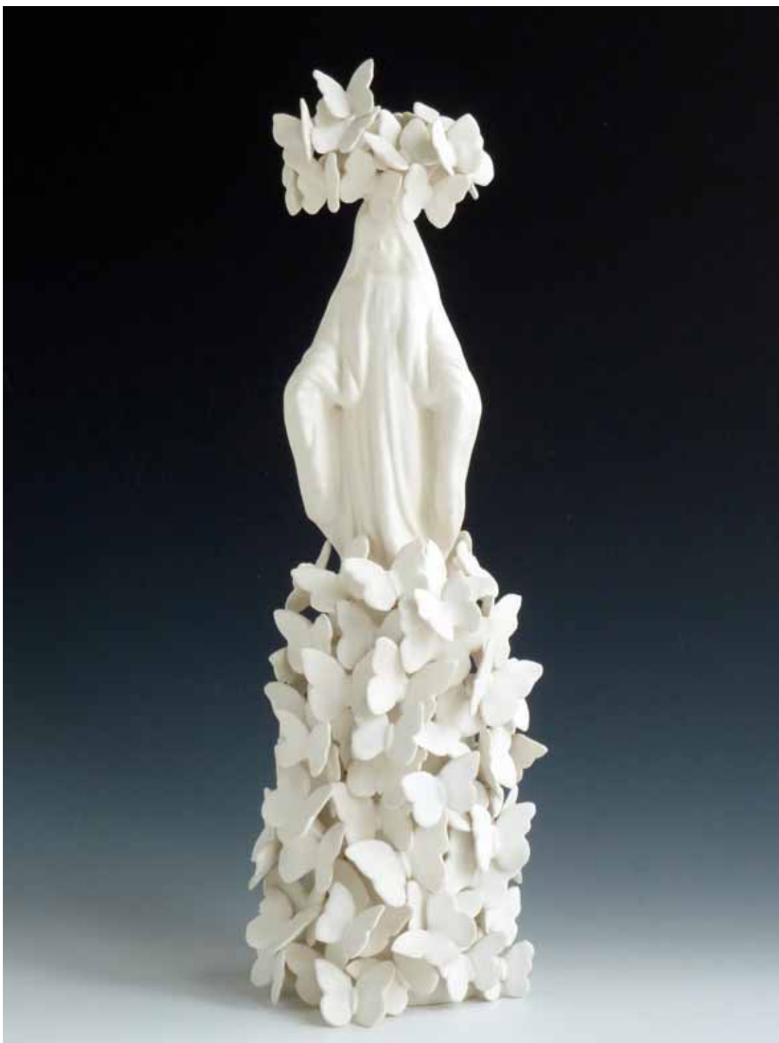
50. Lynda Draper, Mary 2010, hand built porcelainous stoneware, multiple glaze firings, 48 x 16 x 16 cm