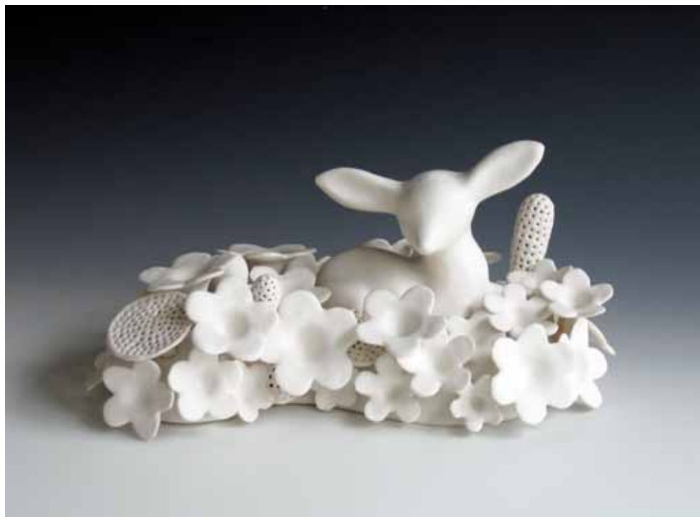
Figure 38. Lynda Draper, Doe 2007, hand built porcelainous stoneware, multiple glaze firings, 13 x 20 x 12 cm