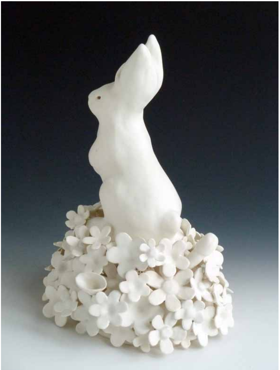
52. Lynda Draper. Rabbit 2009, hand built porcelain stoneware, multiple glaze firings, 35 x 24 x 19 cm