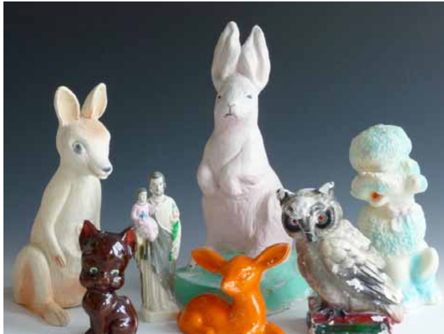
Figure 2. Souvenirs from childhood home Photographer Lynda Draper 2007

together in ‘collusion in which the objects take on a certain density, an emotional value.’ 3 4