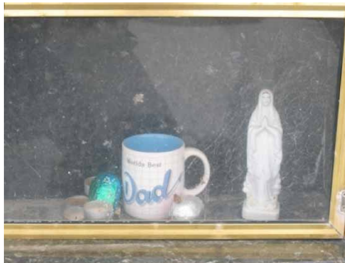
Figure 11. Grave Site in Wombarra Cemetery , a suburb of Wollongong NSW, Australia. Photograph Lynda Draper 2009

objects, reflecting the eclectic nature of the society and the everyday lives of these people, their beliefs, hardships, loves and losses. During commemorative occasions such as the 'Day of the Dead' food and other offerings are placed on these altars to sustain the souls of the departed. These altars tie the living to the dead; the imagination interacting with time and space to create a feeling of the holy, serving to comfort and diminish the fear and separation anxiety caused by the reality of death. 125