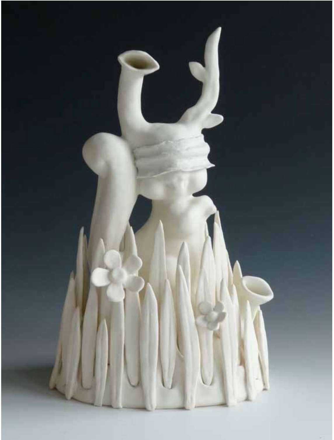
Figure 46. Lynda Draper Squirrel 2009, hand built porcelainous stoneware, multiple glaze firings, polymer clay, 26 x 20 x 12 cm