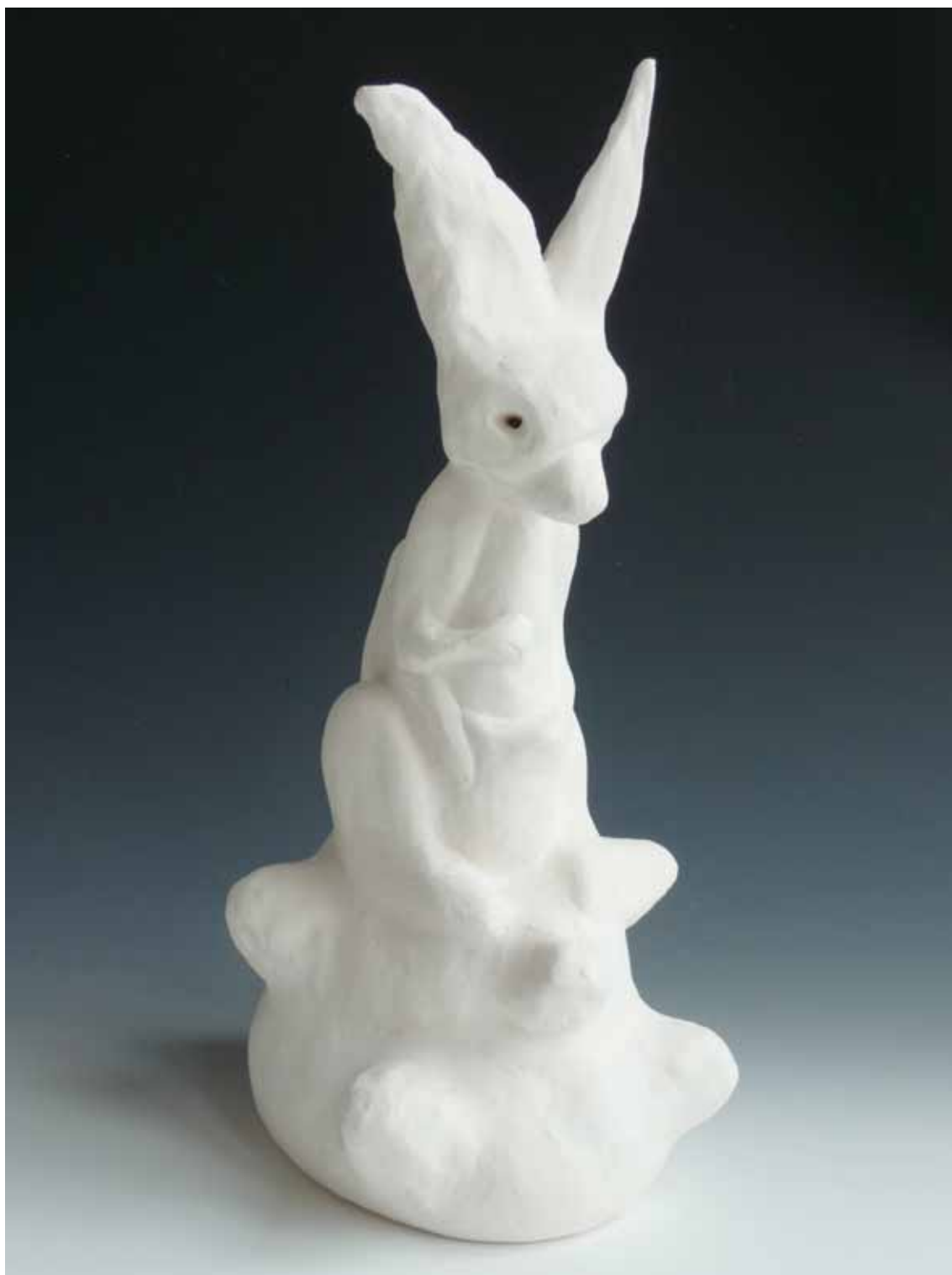
Figure 57. Lynda Draper Kangaroo 2010, porcelainous stoneware, multiple glaze firings, 30 x 24 x 20 x 10 cm