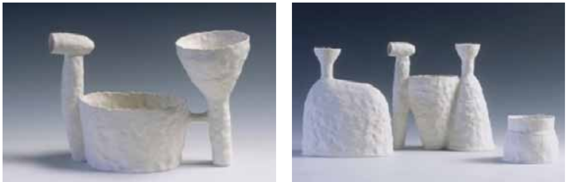
Figure 19. Lynda Draper Still Life 2003, series from Thirroul Home, hand built porcelainous stoneware, multiple glaze firings, each approx 15 x 15 x 10 cm Collection of The International Museum of Ceramics , Faenza, Italy.

I continued working with the domestic hardware from this house focusing on its accumulation of kitchen utensils and working on a smaller scale relative to the intimate relationship I had with the domestic objects. These works echoed the organic seemingly animate nature of this home. They came into being through the process of abstracting from specific inanimate domestic objects, often from more than one source, then fusing them together to produce an object with an identity or life of its own. I have attempted to make ceramic sculptures with a dreamlike or ethereal quality, with the visual fragility of paper or wax but with the resilience and permanence of fired clay. This ghostly reinterpretation of these domestic items returned to inform later works.