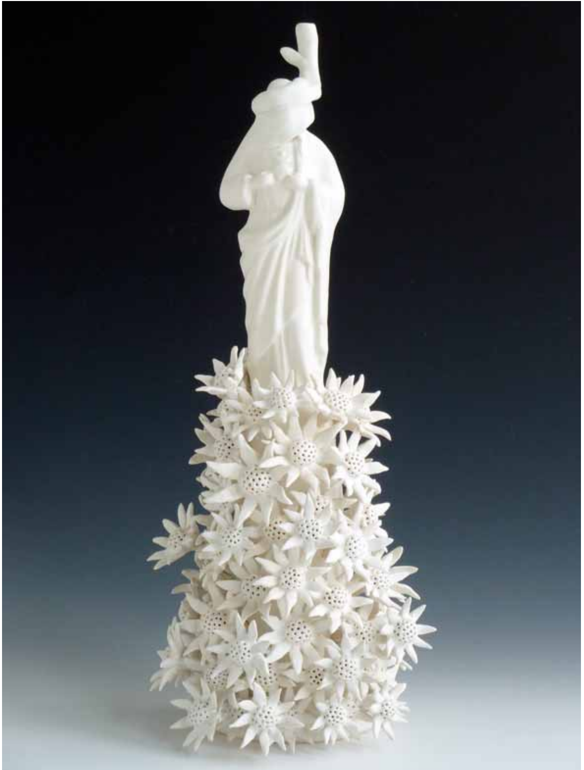
51. Lynda Draper. Jesus II, hand built porcelainous stoneware, multiple glaze firings, 48 x 14 x 14 cm