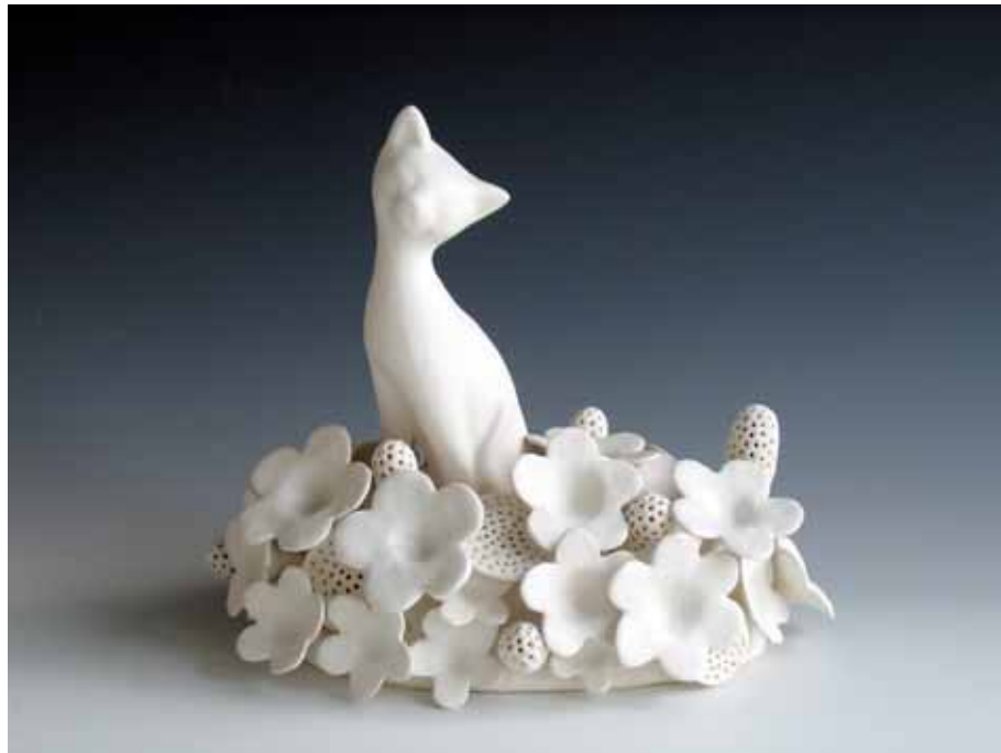
Figure 39. Lynda Draper Cat 2007, hand built porcelainous stoneware, multiple glaze firings, 20 x 21 x 12 cm