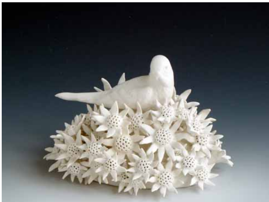
Figure 36. Lynda Draper, Budgie 2009, hand built porcelainous stoneware, multiple glaze firings, 14 x 23 x 16 cm