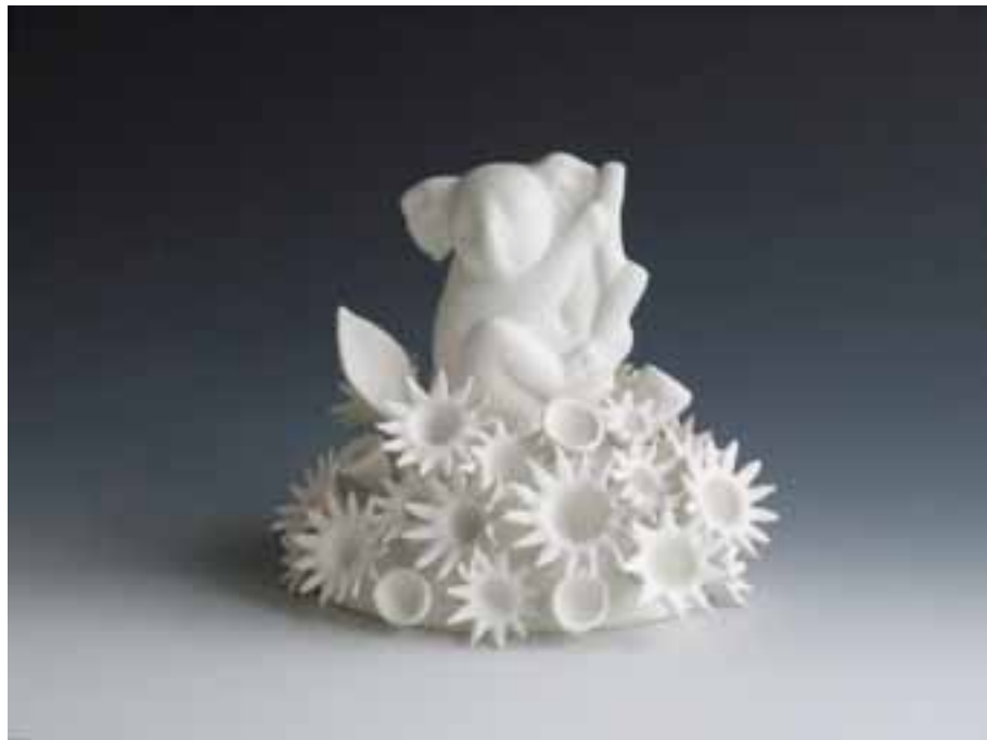
Figure 35. Lynda Draper Koala 2008, hand built porcelainous stoneware, multiple glaze firings, 14 x 16 x 13 cm